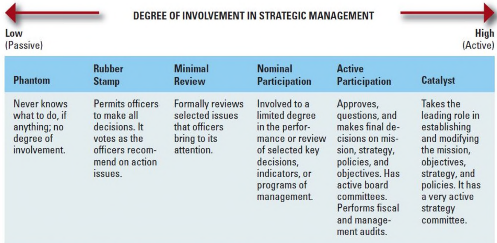
Figure 2-1: Board of Directors' Continuum